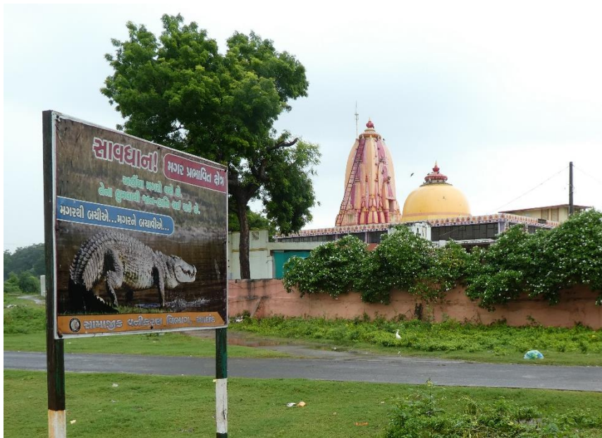
Malataj Village, Gujarat, India