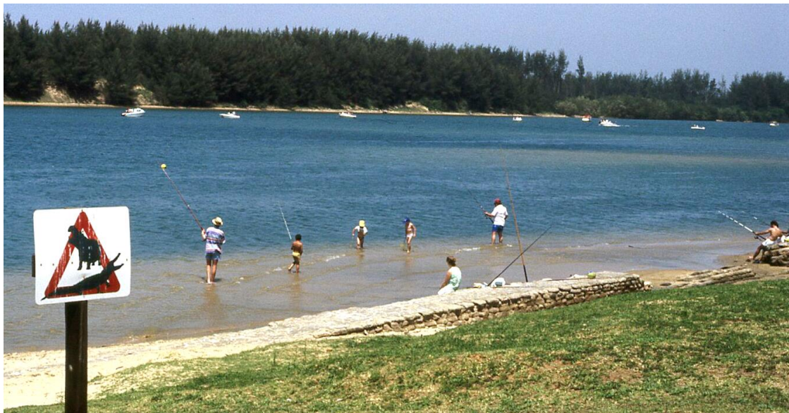
Anglers ignoring safety advice, St Lucia Estuary, South Africa

Rakotondrazafy, A.M.NA., 2009. Impacts du conflit entre homme et crocodile sur la population de crocodiles sauvages à Madagascar. In Proceeding of 1st Workshop of the West African Countries on Crocodilian farming and conservation 13-15 November 2007, La Tapoa Regional Parc W, Niger, pp.65-70. IUCN, Gland, Switzerland.